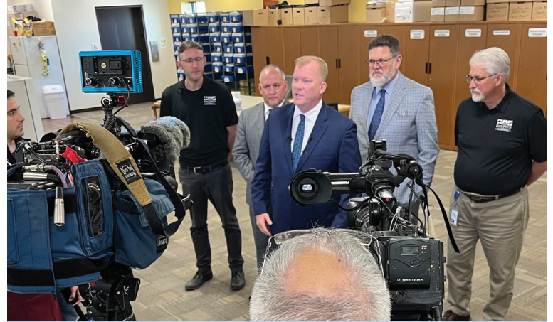
The commissioners and Bureau of Registration and Elections directors discuss Election Day preparations with reporters.

Also new for 2023 elections, pollworkers will have the option of participating in training online before Election Day. Online attendees will continue to receive the training stipend.