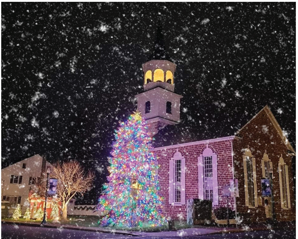
A beautiful, festive display of lights in Middletown.