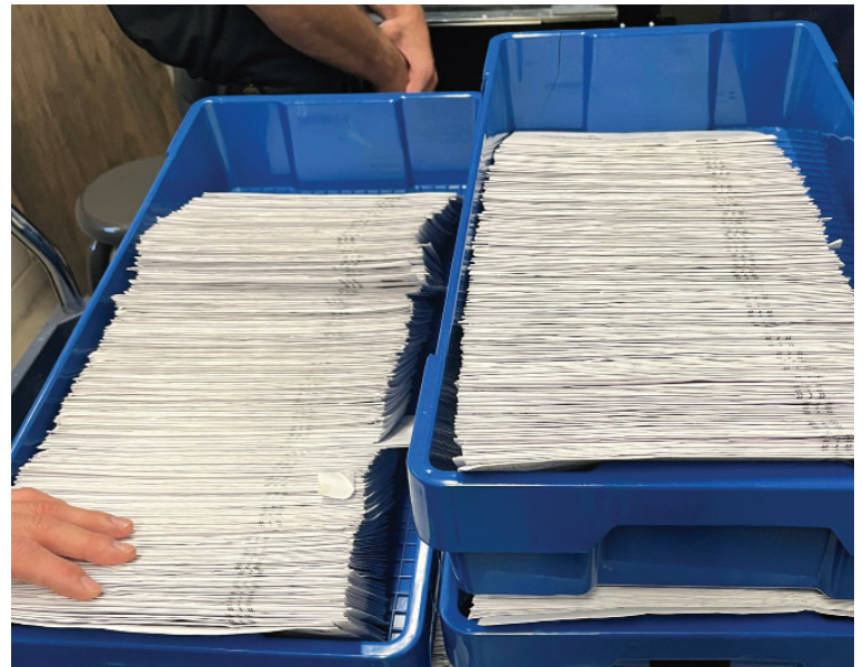
Bins of mail/absentee ballots.